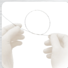
Kink-resistant core-wire available