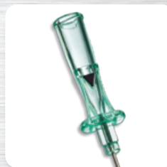
Needle bevel indicator