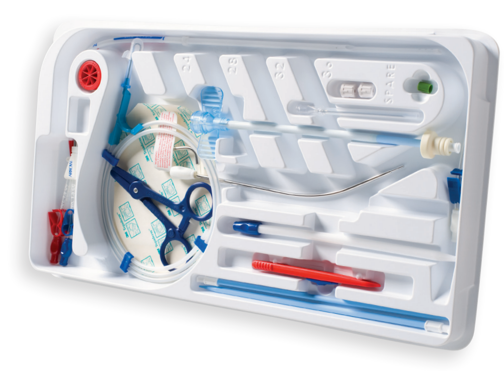
Arrow® NextStep® Antegrade Hemodialysis Catheterization Kit (CS-15232-SFX)

To learn more about Arrow® NextStep® Catheters: contact your Teleflex Representative