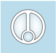
Modified Double-D™ Design