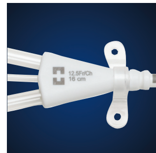
Catheter size on hub