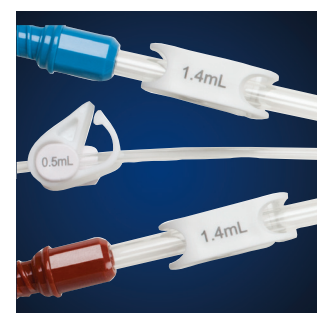
Priming volume on clamps