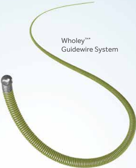
Wholey™ Guidewire System