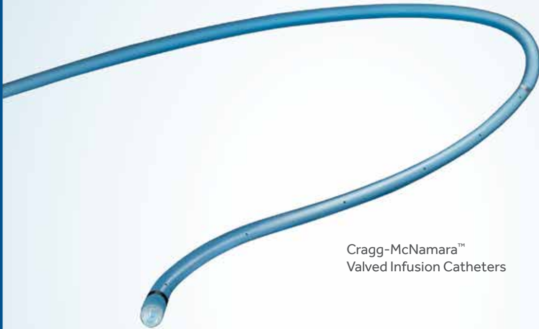
Cragg-McNamara™ Valved Infusion Catheters