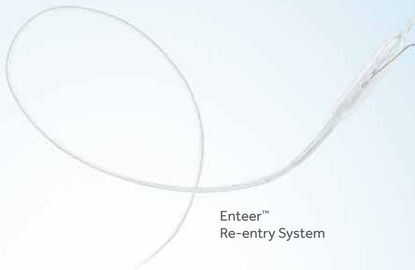
Enteer™ Re-entry System