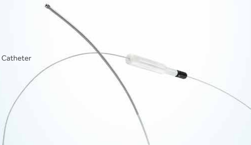
Viance™ Crossing Catheter