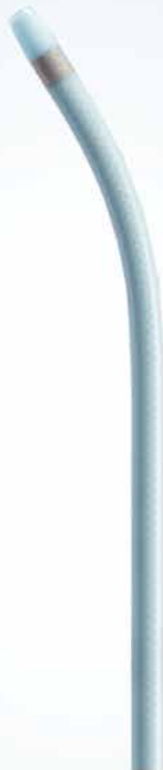
TrailBlazer™ Angled Support Catheter