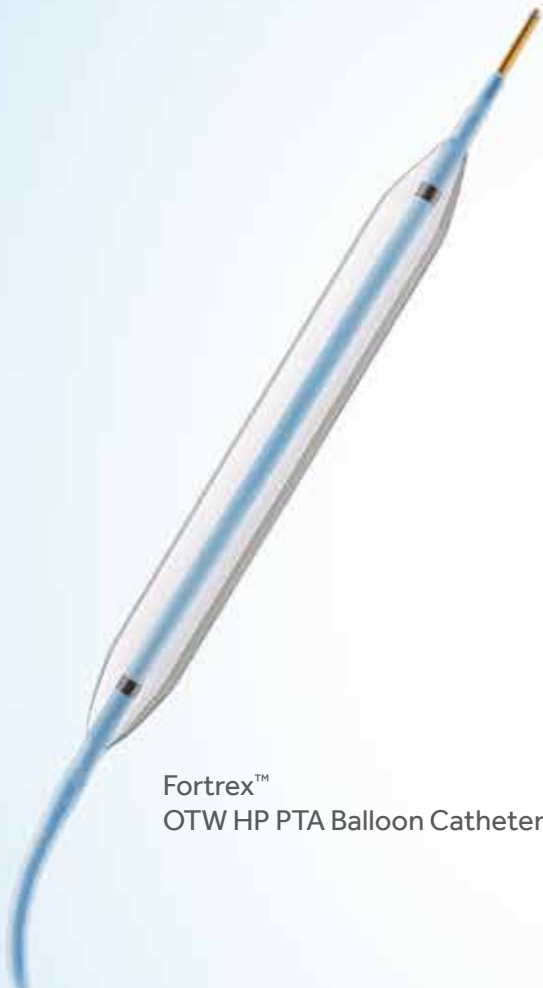
Fortrex™ OTW HP PTA Balloon Catheter