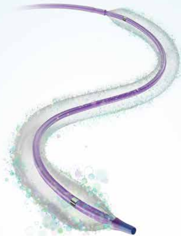
IN.PACT™ Admiral™ Drug-Coated Balloon