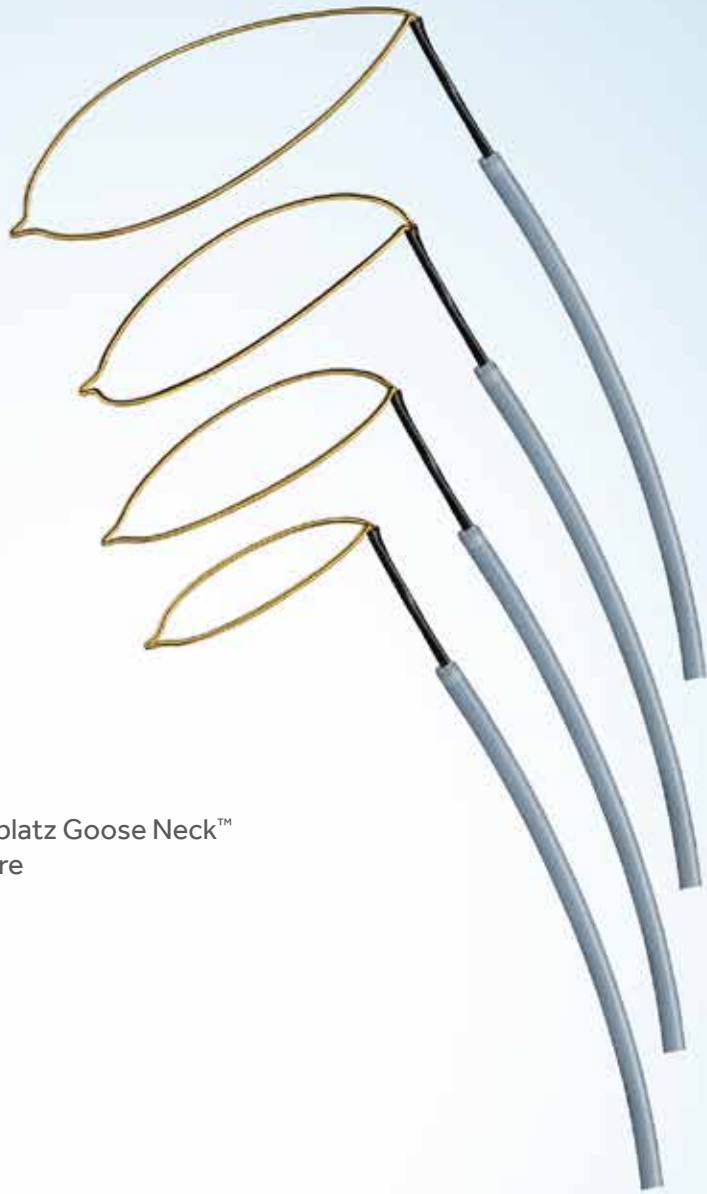
Amplatz Goose Neck™ Snare