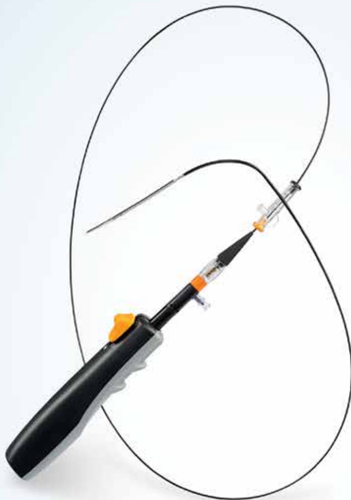
HawkOne™ Directional Atherectomy System