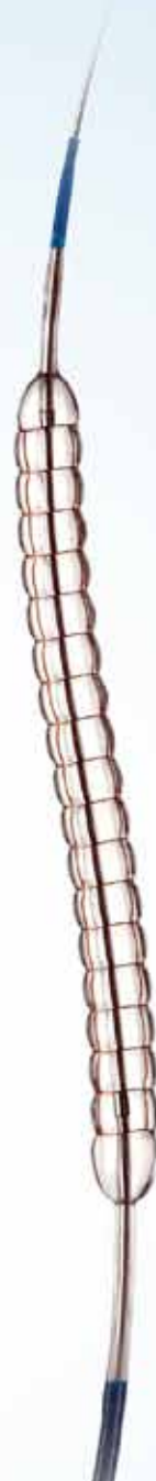
Chocolate™ PTA Balloon Catheter