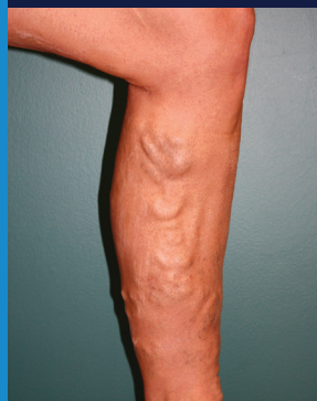
BEFORE ClosureFast procedure