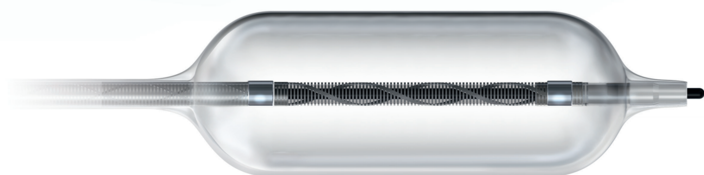
Balloon and Balloon Support with Microfabricated Infusion Ports